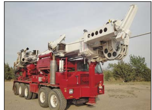
2006 SCHRAMM T-130XD