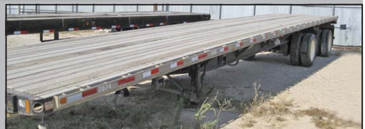
1999 FONTAINE FLOAT