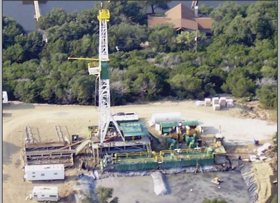
SHAFFER SOS 6000