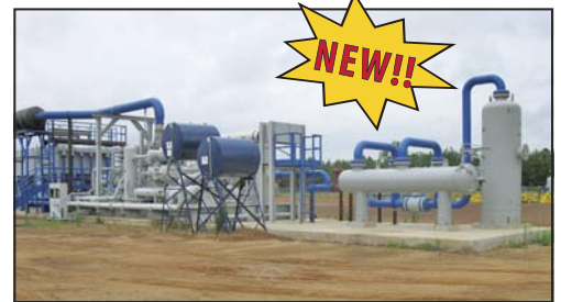
NEW ARIEL COMPRESSORS