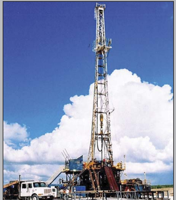
C-E RIG NO. 1

Corporate Headquarters Address: P.O. Box 4038 • Bergheim, Texas 78004 Phone (830) 336-3983 • Fax (830) 336-3984 • www.cannonsalesinc.com