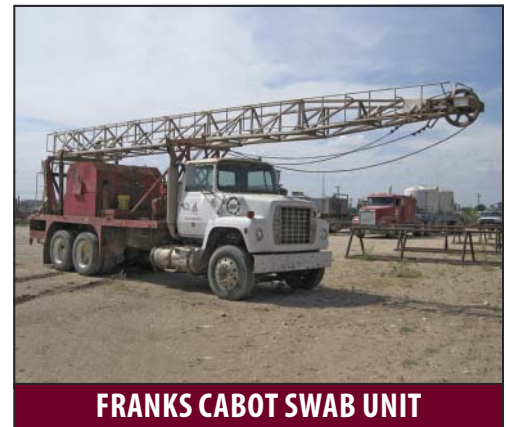
FRANKS CABOT SWAB UNIT