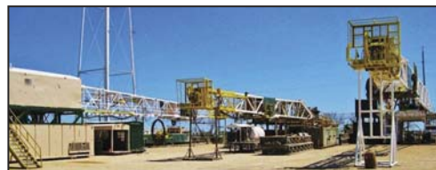
RIG NO. 22 / RIG NO. 21 / RIG NO. 24