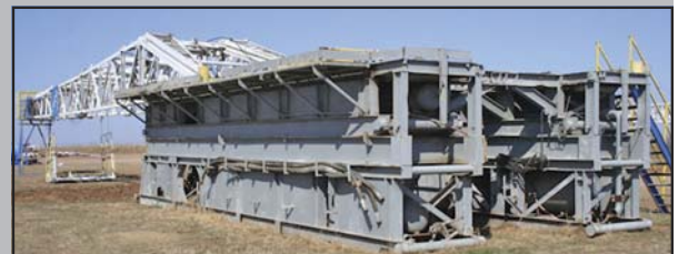
LCM 127'H CANTILEVER MAST 288,000#