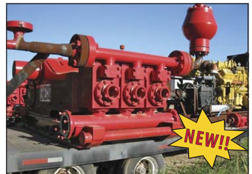
(2) ELLIS WILLIAMS PUMPS