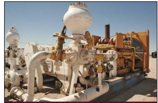
PZ 9 TRIPLEX PUMP P/B CAT D398

1502 IRON CHOKES MANIFOLD , 5 Valve, 2", 15,000# Choke Manifold W/ (15) 10' Joints Of Flowline (Used 1 Time) Mounted On A 2011 Big Tex T/A Monorail Trailer, Model 14PI-