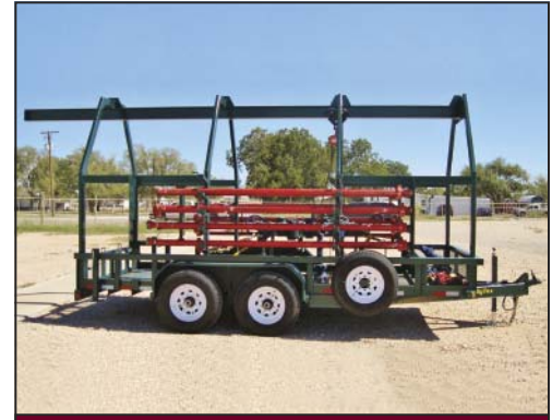
1502 CHOKES MANIFOLD