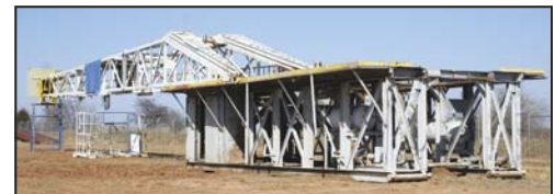
A&M MAST & SUB