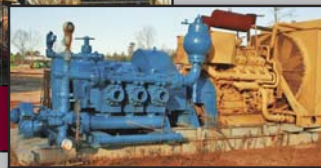
CE F-650 PUMPS