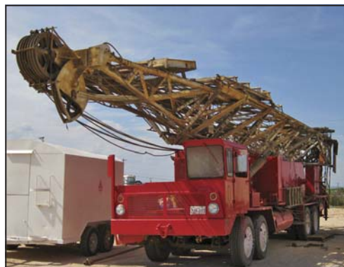
FRANKS 1287 D/D WELL SERVICE RIG

SPENCER HARRIS 7000 Single Drum Drawworks, S/N 62, p/b (2) Cat 3406DI 350 HP Diesel Engines, (2) TWIN DISC 1F-11524-TC-1Torque Converters, Mounted on SPENCER HARRIS 3-Axle Trailer; SPENCER HARRIS 97'H X 8'W 250,000# Telescoping Mast, 11' X 11'6" X36'L T-Type Substructure, 7'7"W X 53'L Trailer Ramp; (2) CONTINENTAL EMSCO F-650 Triplex Mud Pumps, Each P/B CAT D379 665 HP Diesel Engine; (2) CAT SR4B 320 KW AC Generators, each P/B CAT 3406 Diesel Engine, SANBORN Air Compressor, KOOMEY 3-Station Closing Unit, All mounted in Tandem Axle Trailer; Two Pit Mud System, 430 BBL Capacity, BRANDT Triple Screen Vibrating Shale Shaker, BRANDT Desander and Desilter, HALCO 5 X 6