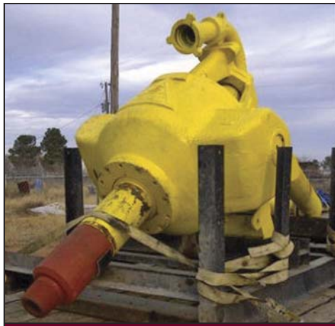
C/E LB 650 SWIVEL