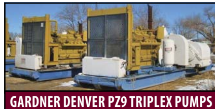
GARDNER DENVER PZ9 TRIPLEX PUMPS

LEE C MOORE DERRICK , 142', 25' Base, 6 Sheave, 12 Lines, 703,000#, S/N 3213; (66) 4-3/4" DRILL COLLARS , XH Connections; DRILL PIPE , 3-1/2", 4-1/2", 5" DWB & YB; PIPE TUBS