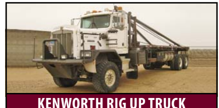
KENWORTH RIG UP TRUCK