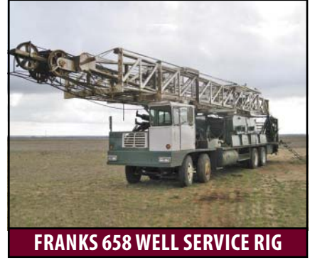
FRANKS 658 WELL SERVICE RIG