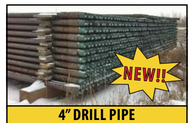
4" DRILL PIPE

57,907' of 4" S-135 15.70# New Drill Pipe with, TSDS38 (Double Shoulder-High Torque 3 1/2" IF) Connections, 5" O.D. x 2 9/16" I.D., 2" Longer than Standard and TK34 Internal Plastic Coating. Manufacturer is Texas Steel Conversion with Mill Certs