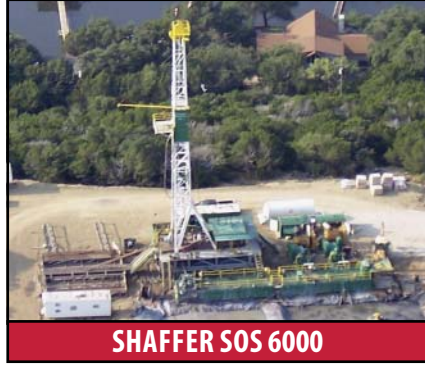
SHAFFER SOS 6000