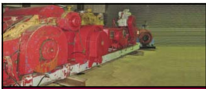
NAT 50CA COMPLETE DRWKS