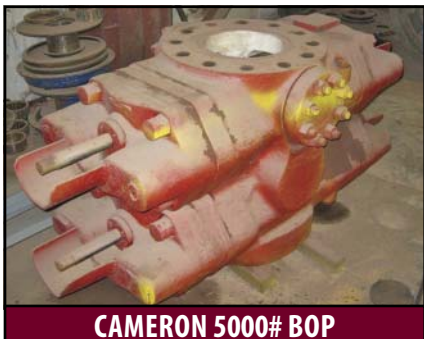
CAMERON 5000# BOP