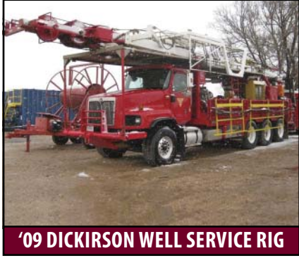
'09 DICKIRSON WELL SERVICE RIG