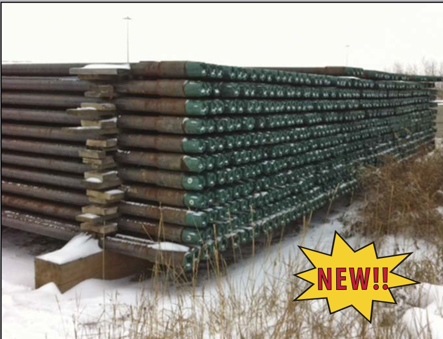
4" DRILL PIPE