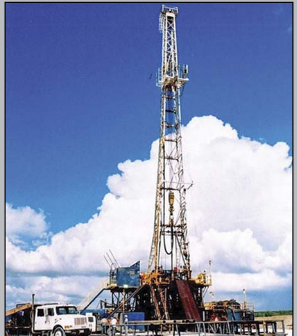
C-E RIG NO. 1

Corporate Headquarters Address: P.O. Box 4038 • Bergheim, Texas 78004 Phone (830) 336-3983 • Fax (830) 336-3984 • www.cannonsalesinc.com