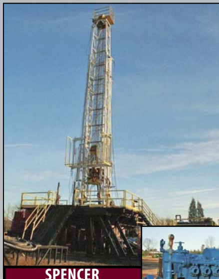
SPENCER HARRIS 7000