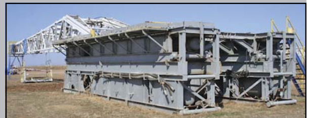
LCM 127'H CANTILEVER MAST 288,000#