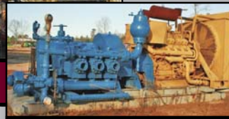
CE F-650 PUMPS