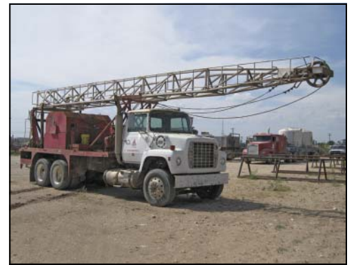
FRANKS CABOT SWAB UNIT