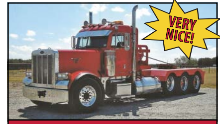
2000 PETERBILT 379

1982 VULCAN T/A 40'L Long Oilfield Float w/ Rolling Tailboard