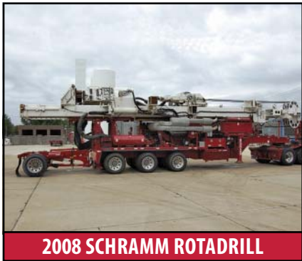
2008 SCHRAMM ROTADRILL