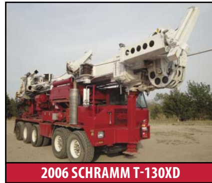
2006 SCHRAMM T-130XD