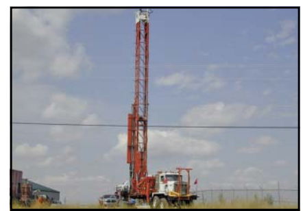
2002 SCHRAMM T685DHH

8,618' 4-1/2" Drill Pipe, 4-1/2"XH, Mixed Grade; (12) 6" Drill Collars w/4-1/2"XO Conns; CASING: 9-5/8", 53.50, HCP-110/Q, 3444'; 9-7/8", 61.80, Q-125, 13,229'; 9-7/8", 62.80, HCP-110, 5362'