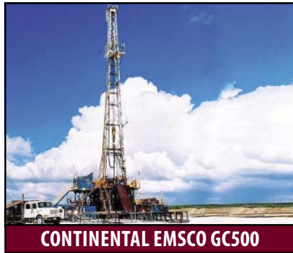
CONTINENTAL EMSCO GC500